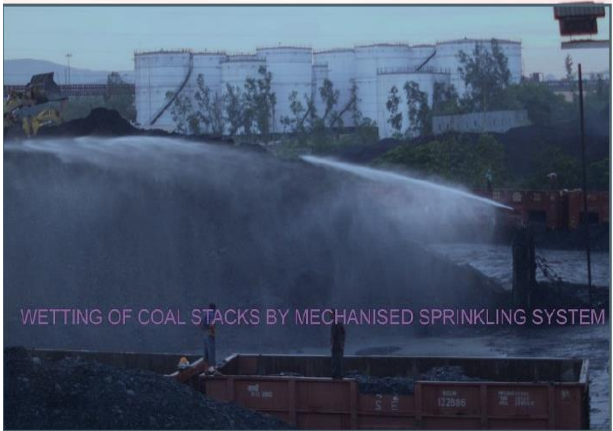
WETTING OF COAL STACKS BY MECHANISED SPRINKLING SYSTEM