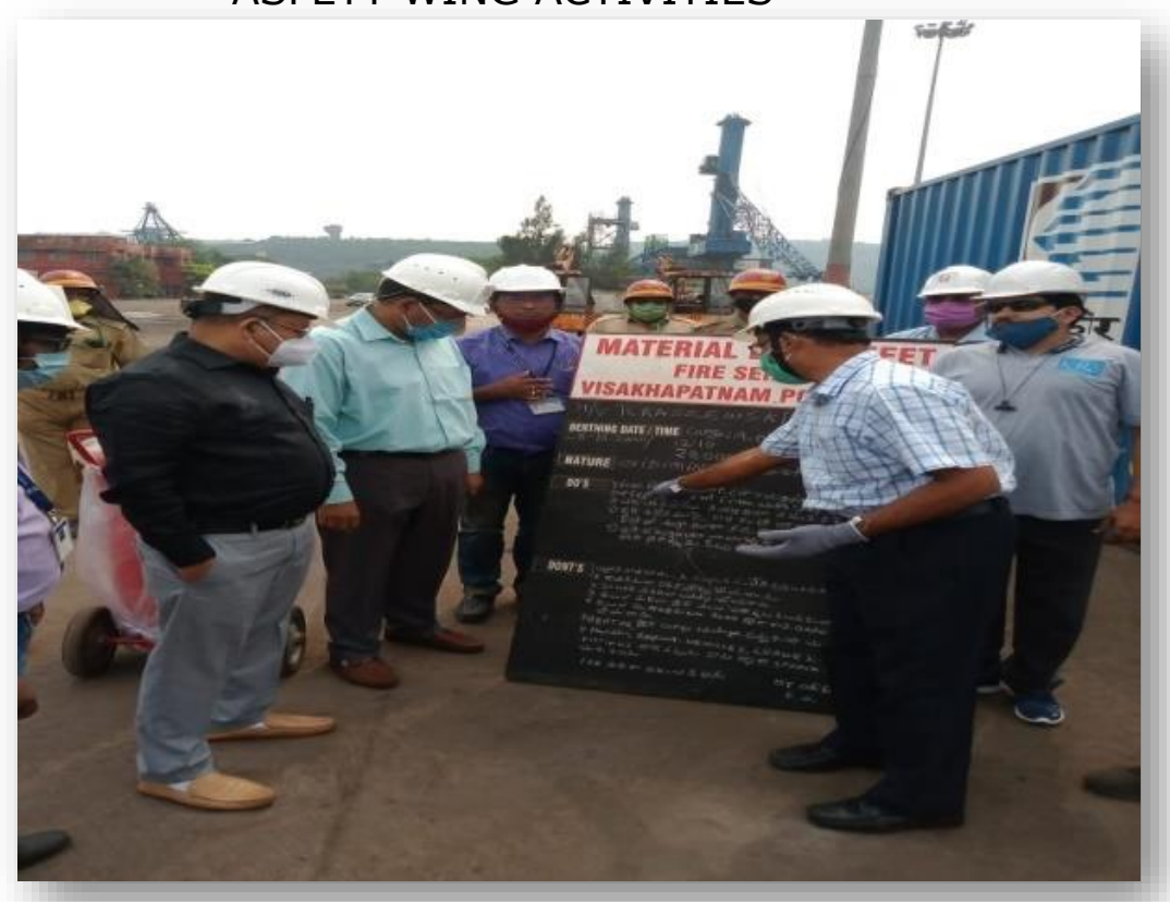
STATUTORY INSPECTION BY Dy. Jt.Chief Commissioner of PESO.