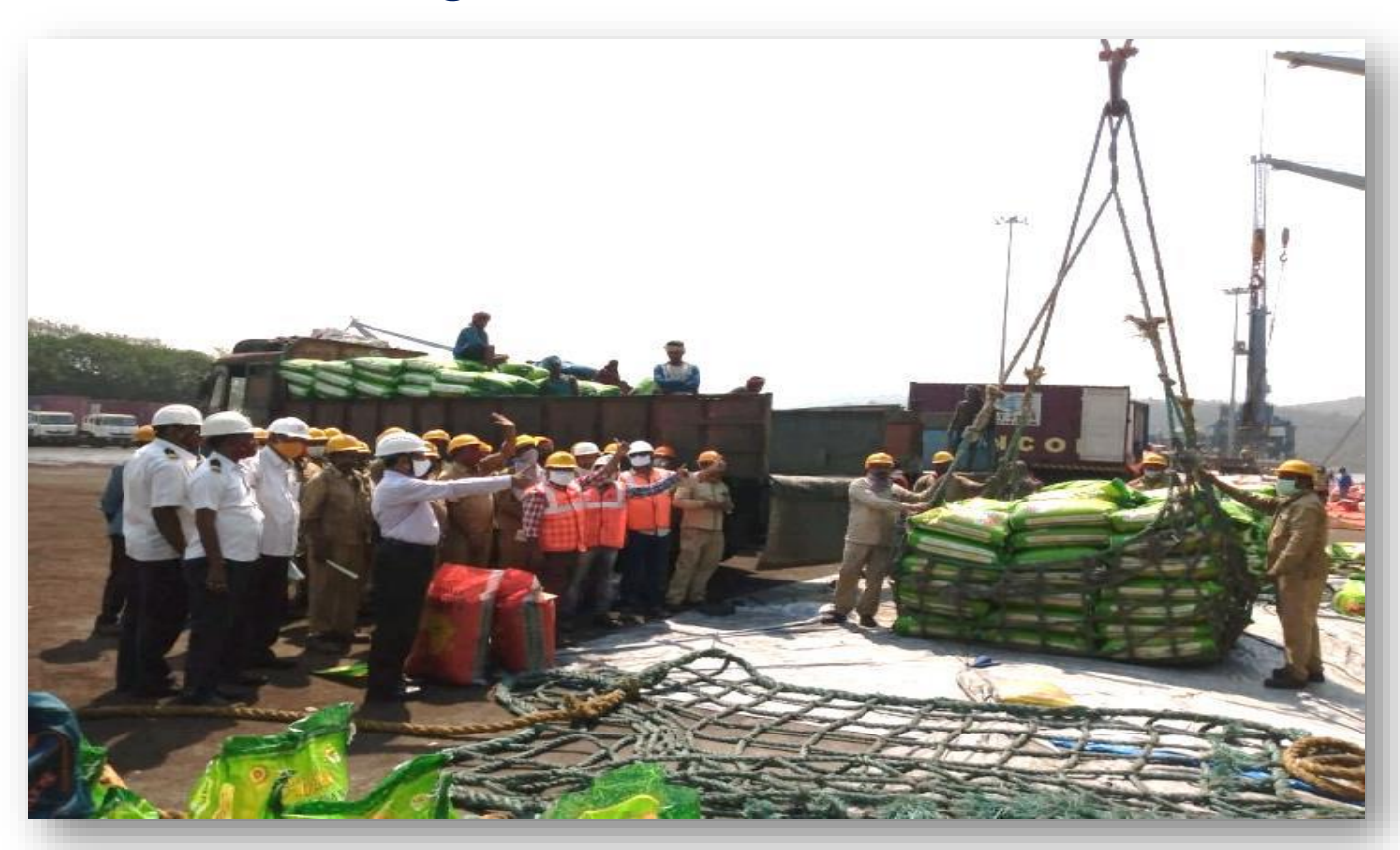
On the job Training by Port Safety Committee.