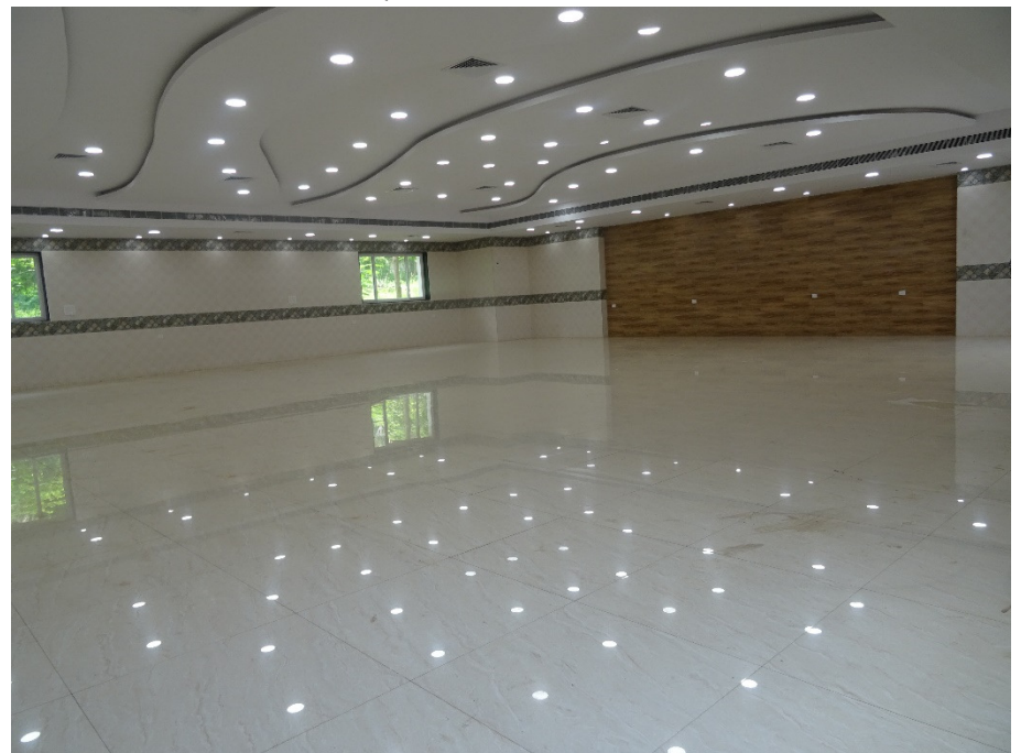
BANQUET HALL 2