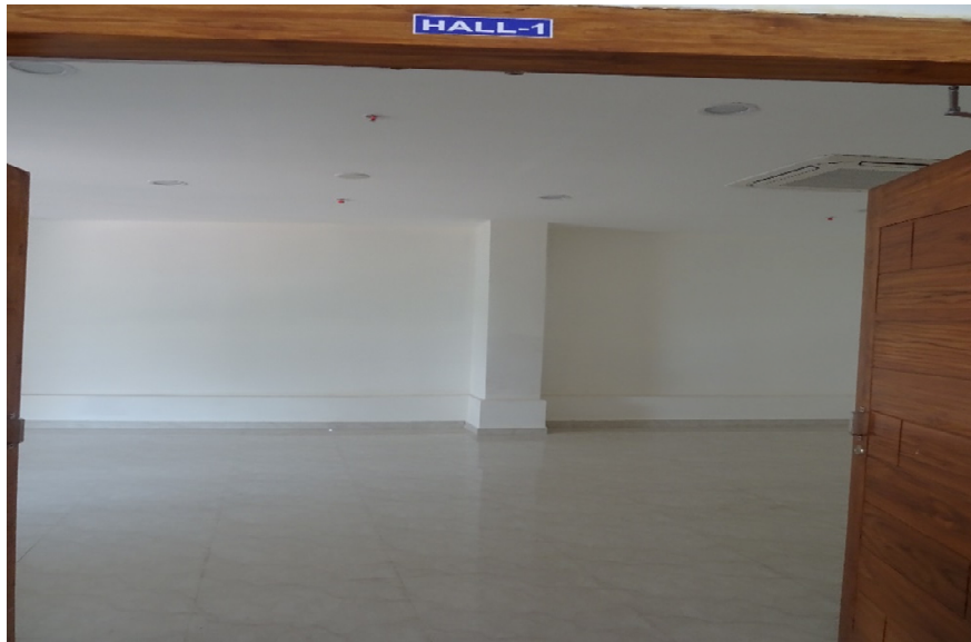
MINI HALL 1