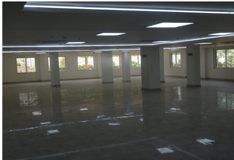
BANQUET HALL / DINING HALL