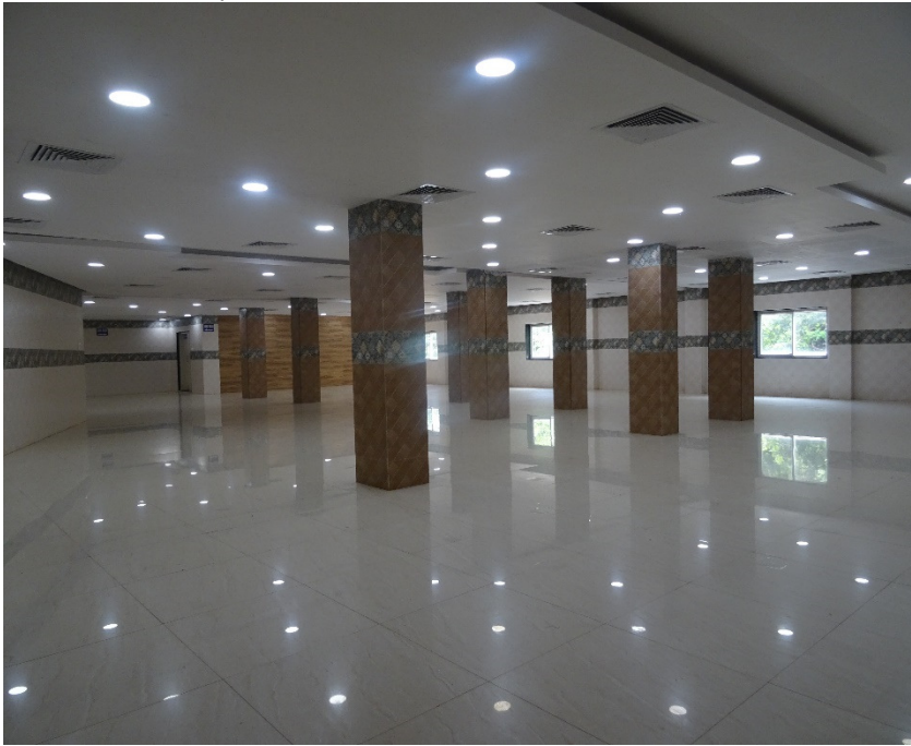
BANQUET HALL 1